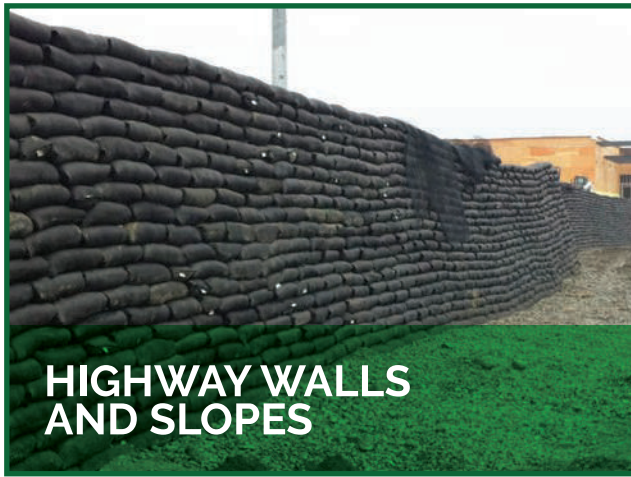
HIGHWAY WALLS AND SLOPES