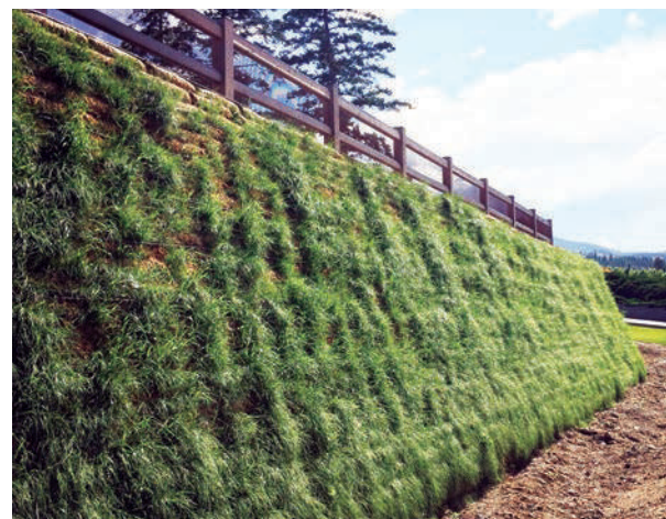
5m (16ft) tall landscape retaining wall

The Flex MSE Vegetated Wall system provides the strength of interlocking components without the need for concrete, rebar, wire mesh or other formwork.