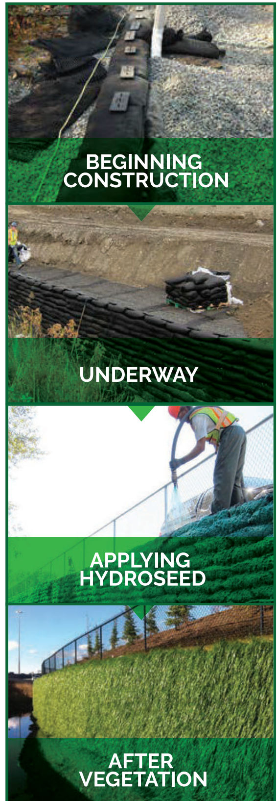
5m (16ft) tall commercial retaining wall