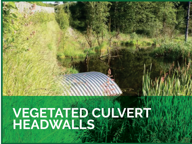
VEGETATED CULVERT HEADWALLS