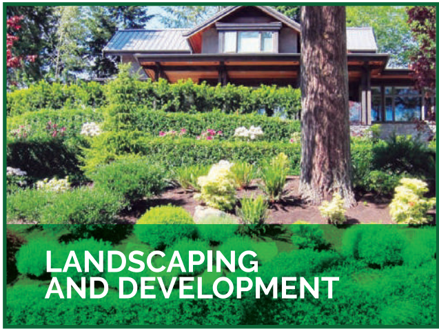
LANDSCAPING AND DEVELOPMENT